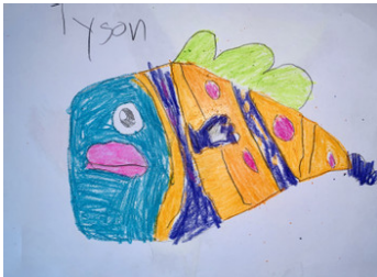
Check out the awesome pattern fish by Tyson W.!

This week, our K-2 scholars created patterned fish inspired by the book Only One You by Linda Kranz. Next we expanded on that knowledge to see that repeating different shapes and lines can give the illusion of texture in our drawings!