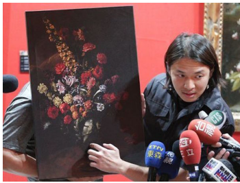
Click the photo above for a video of this accident!

During a visit to the Huashan 1914 Creative Park in Taipei in August 2016, a 12-year-old boy tripped and stumbled into a $1.5 million Paolo Porpora painting. Mid-fall, the boy leaned into the painting (drink in hand) and punched a whole right through the canvas!