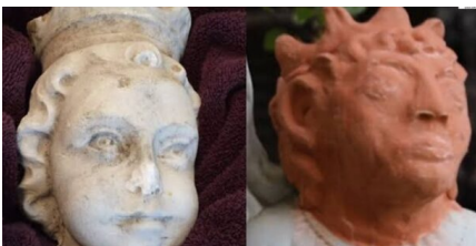
The sculpture of a child's head (left) was "restored" (right).

This restoration had portions of the face missing and needed some routine maintenance. This is how it came back to the owner.