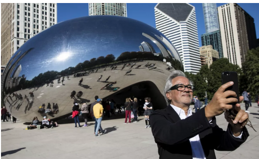
Anish Kapoor standing in front of his sculpture, Cloudgate , in Chicago, IL.