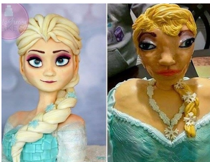
The cake sculpture on the right didn't quite turn out the way they had hoped!