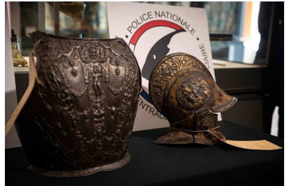
Just how the pieces came into the Bordeaux family's possession is yet to be determined. Local authorities are still investigating.