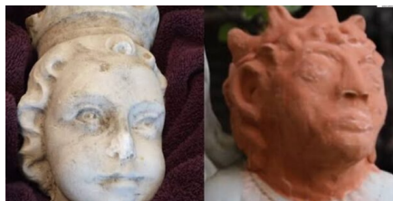
The sculpture of a child's head (left) was "restored" (right).

This restoration had portions of the face missing and needed some routine maintenance. This is how it came back to the owner.